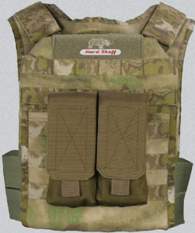
PLATE CARRIER VEST- SLICK II